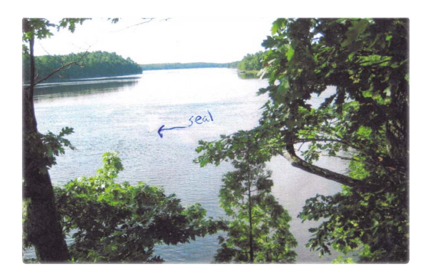
Figure 3: Picture of Bluff Head disposal area August 31, 2009, looking south. With a seal near the point of the arrow.

They were visibly disturbed by the dumping and the high turbidity. When USACE, MEDEP and BIW came to the location in November 2009 during the dredging disposal period, so that I could have them see the effect of the dredging disposal, they saw one of the seals. Although the seals came back briefly in January, they appear to have moved on and are no longer in the area. Transitory seals do go in and out with the tide during portions of the year. Today, March 20, 2011, a seal was once again vigorously fishing and keeping me in its awareness. The seal seemed to enjoy my whistling – though I can't tell if it was one of the three seals from 2009.