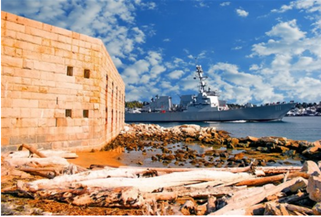
Figure 1: The U.S.S. Spruance seen leaving the mouth of the Kennebec River at Fort Popham in February 2011

Thus, the evidence currently fails to show the need for out-of-season dredging in either location. This is particularly true for the North Sugarloaf Island reach, which is only partially shoaled and is open for ship passage at MLLW depths of 27'. Neither the BIW nor the Army Corps' memorandums and emails explaining the need for this project state that August dredging is necessary in the North Sugarloaf Island reach to allow the Spruance to safely transit the river. 11 Barring new evidence to the contrary, no action at North Sugarloaf Island is clearly practicable and less environmentally damaging.