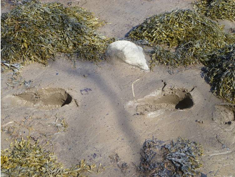
Figure 2: A thick layer of sand still coats the western shore of the Kennebec Narrows approximately 17 months after being deposited from the dumping of dredge spoils in 2009

Sustained burial of the Kennebec Narrows' normally rocky shoreline under a thick layer of sand and mud fundamentally alters normal conditions and detrimentally affects the resident biological community by filling interstices and smothering habitat. This is a clear violation of class SB habitat and aquatic life standards. Although Appellants raised this concern during the public comment period, the Department made no effort whatsoever to review this concern or even respond to the Appellants concerns. See Order at 6-7.