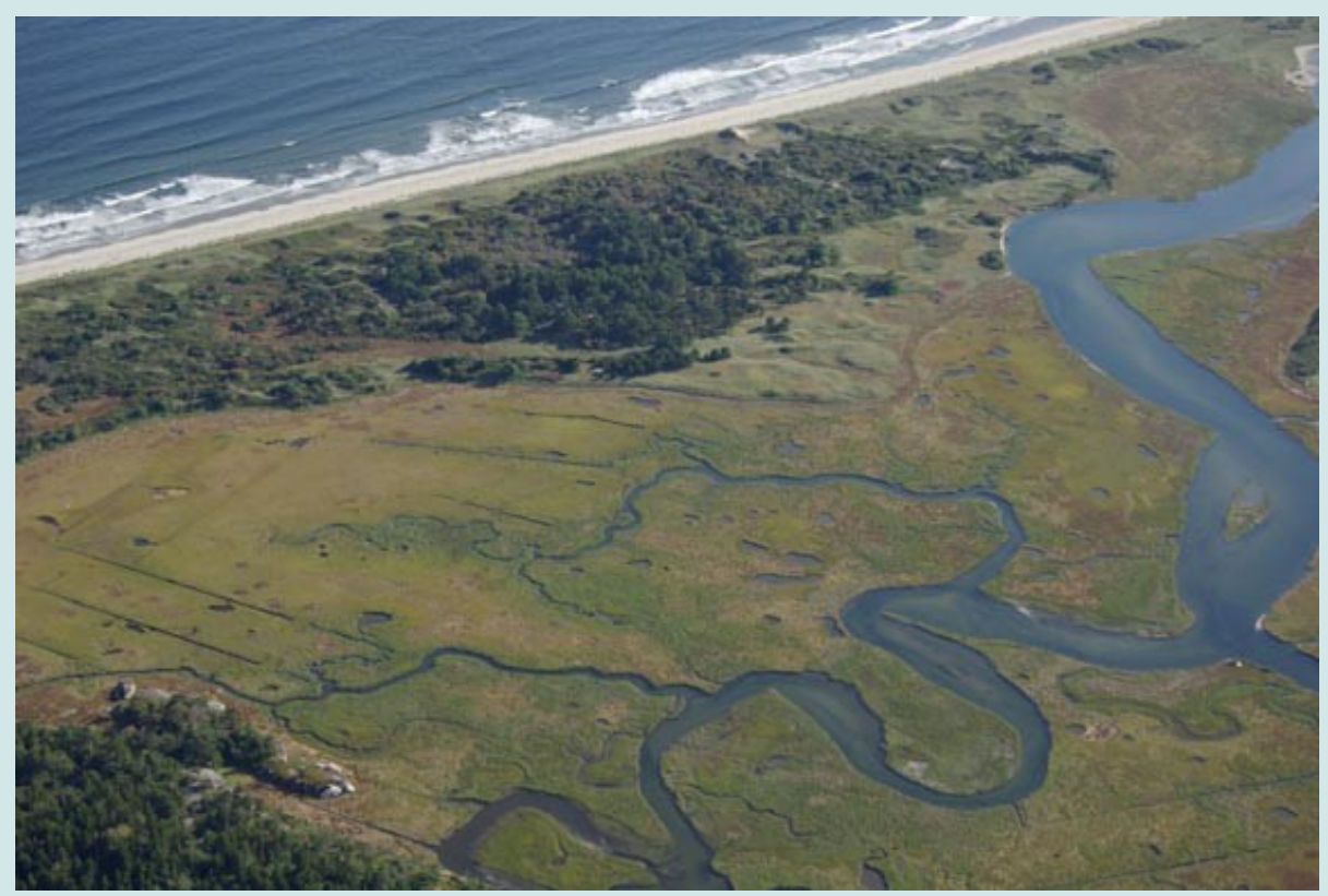
The Sprague River beach and coastal marsh complex in Phippsburg supports several known elements of ecological management interest, including shorebird feeding and roosting areas and essential habitat for endangered terns and plovers. Marshes like this one are particularly vulnerable to climate change-induced permanent flooding, increased salinity, and storm-associated shifts in coastal morphology.