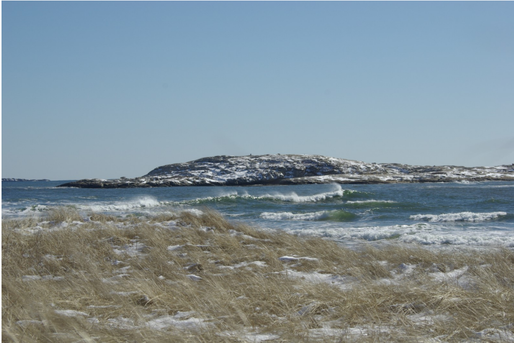
Winter waves batter Popham Beach at high tide, inducing a landward retreat of terrestrial plant communities. Combined with more frequent and intense storms, predicted accelerations in sea level rise threaten to reshape vulnerable sections of Maine's coast.

Sea level rise (SLR) due to melting glaciers on land and thermal expansion of the ocean represents a major agent of change to coastal ecosystems (IPCC 2001; Pugh 2004). Several researchers estimated an averaged global SLR rate of 1.6–1.8 mm (0.06–0.07 in.) per year from 1880 to 2000 (Church et al. 2004; Bindoff and