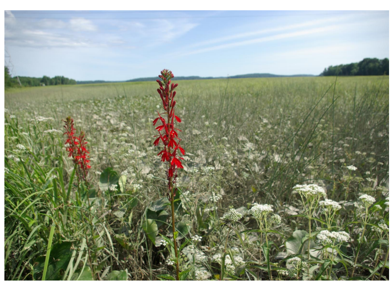
Cardinal flowers ( Lobelia cardinalis ) regally mark the upper intertidal zone on the rocky slope of a Merrymeeting Bay causeway. Where landward transgression is hindered by steep landforms, unsuitable soil conditions, or human infrastructure, the resilience of some intertidal communities to accelerated sea level rise will be compromised.

The work of Kirshen and colleagues (2004, 2006) provided a comparison of potential economic impacts associated with climate change in the context of how adaptive actions and policies can mitigate those impacts. Depending on the magnitude of sea level rise and the adaptive actions taken, storm damage to infrastructure and associated emergency costs in the Boston area were predicted to range from $20-$94 billion between now and 2100. In the absence of increased SLR rates associated with climate change, costs could reach approximately $7 billion if flood management policies are not updated.