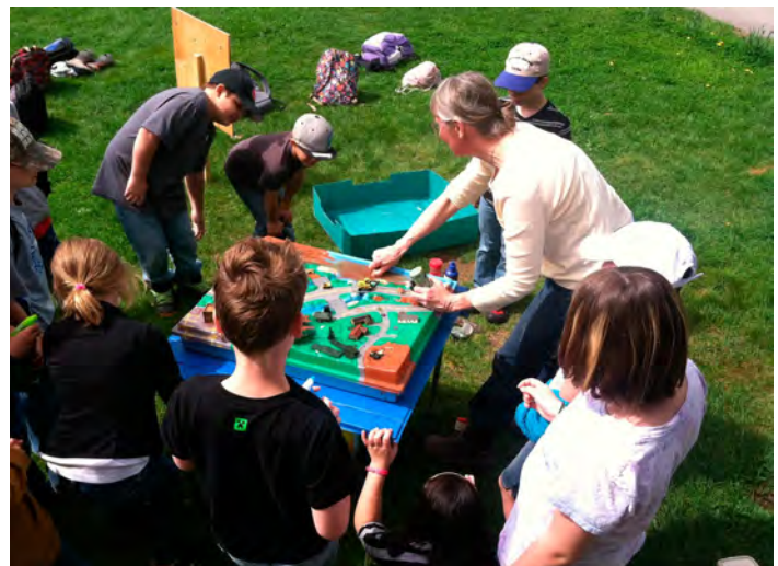
Non-point source pollution.

Fall Bay Day takes place on September 23rd at the Wildlife Management Area in Bowdoinham. We would love to have you as a volunteer!