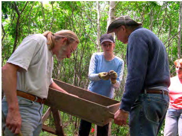
Volunteers at our 2009 Thwing's Point dig.