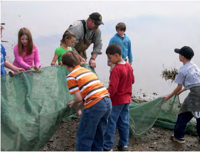
Stacking the seine at Bay Day.

On each end of the net there is a staff, used both as a handle to pull it through the water and to keep it from collapsing. On the top there are a series of spaced-out floats or corks to keep the net on the surface. On the bottom of the net are a series of weights called leads. These keep the net firmly affixed to the bottom. Depending on the location the seine can be deployed from a boat or from shore, or a combination of both. We at DMR wear chest waders in most weather to stay dry and keep the cold water at bay. In the high summer we sometimes just go in shorts, which is a true pleasure.