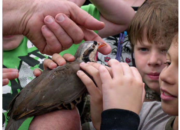
Hands-on at Conservation Canines.