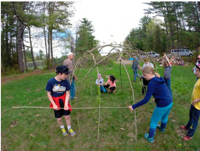
Building a wigwam.