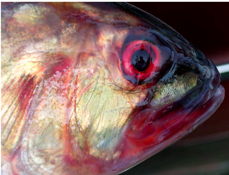
American Shad- Ed Friedman

Everyone employed in the Shad business is reaping a bountiful harvest. There are six or eight large weirs in the river, in the Bay or down by Abbagadasset Point. From the weirs near the village, heaped up boatloads are taken to the wharf where they are taken by the cart load and packed in ice for shipment. Even those using drift nets at night catch one or two hundred fish on each tide, giving them $10 or $20 as Shad sell right now (10 cents each). Two or three thousand fish are shipped from here by train each day and a large number is also shipped from the station at Harwood's (East Bowdoinham).