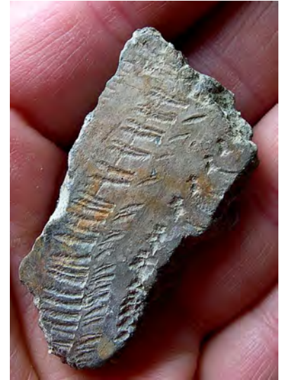
Dentate rocker stamped pottery sherd - Ed Friedman