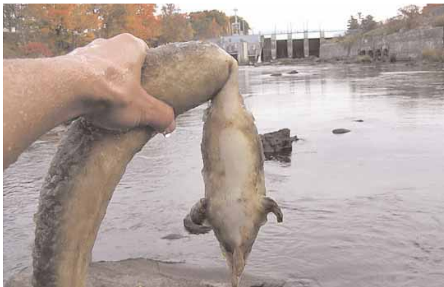
4 ft. female American Eel slaughtered by turbines of Benton Falls Hydro Dam, Sebasticook River, Benton, Maine. 14 October 2004.

NEWS ITEM: On March 10, 2004 the Atlantic States Marine Fisheries Commission's American Eel Management Board recommended that the United States Fish & Wildlife Service (USFWS) and the National Marine Fisheries Service (NMFS) consider designating the entire coast wide stock of American Eel as a candidate for listing under the Endangered Species Act (ESA).