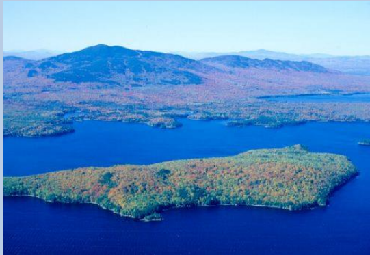
Aerial view of Moosehead Lake, Moose Island, and Squaw Bay, Maine.

Our ongoing work in the Western Wildway has shown us that partnerships are key to bringing a wildway to life. In 2015, we formed the Eastern Wildway Network (EWN) to advance our efforts in eastern North America—more than 30 conservation leaders working to restore, reconnect, and protect regional habitats, and to help native species move safely through the landscape and adapt to climatic change. We’re also promoting the recovery of keystone species like wolves and cougars .