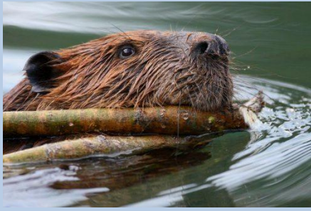
American beaver.

As a result, Eastern biodiversity is in jeopardy. In the Southern Appalachians alone, more than 190 aquatic species and 50 species of terrestrial plants and animals are formally listed as endangered or threatened under the U.S. Endangered Species Act. Wolves and cougars are all but gone from eastern North America, as are their beneficial effects as keystone predators.