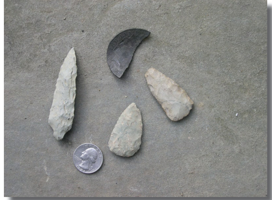
three points and half of a 1793 Spanish silver Reale

permanent protection of over 1,300 acres and 11 miles of shoreline around the Bay. The Houdlette Conservation Project will permanently protect an incredibly important series of parcels on the shore of Merrymeeting Bay in Dresden, Maine. This FOMB project prevents poorly planned growth, protects water quality of the Bay, provides recreational opportunities, and conserves both extremely high value wildlife habitat and one of